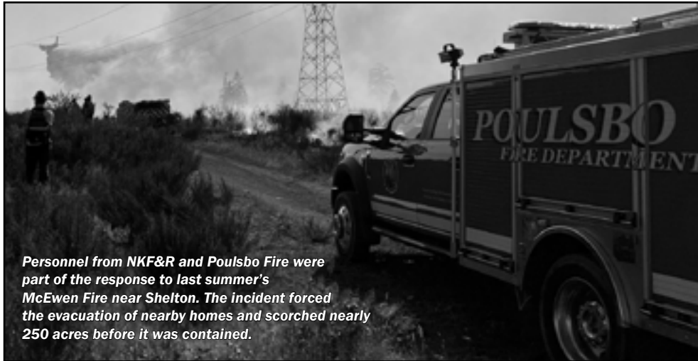
Personnel from NKF&R and Poulso Fire were part of the response to last summer's McEwen Fire near Shelton. The incident forced the evacuation of nearby homes and scorched nearly 250 acres before it was contained.

You can prepare your home and property to be more wildfire-resistant, too. Find tips, how-to info and checklists online at www.wildfireready.dnr.wa.gov and www.firewise.org .