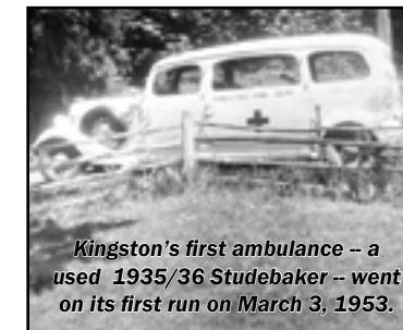
Kingston's first ambulance -- a used 1935/36 Studebaker -- went on its first run on March 3, 1953.