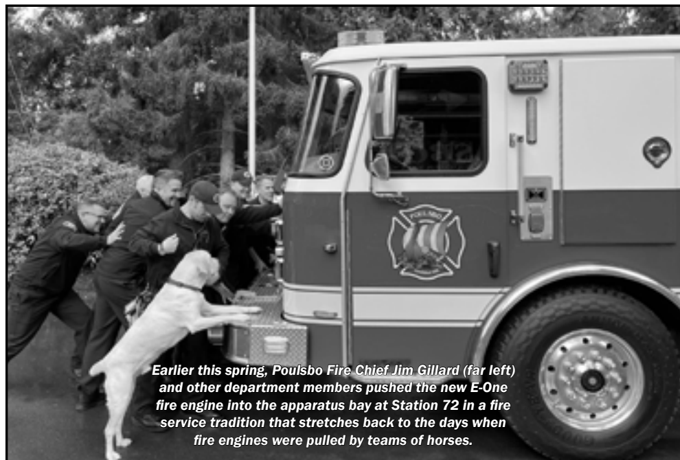
Earlier this spring, Poulsbo Fire Chief Jim Gillard (far left) and other department members pushed the new E-One fire engine into the apparatus bay at Station 72 in a fire service tradition that stretches back to the days when fire engines were pulled by teams of horses.