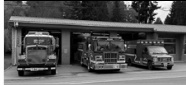
Among the concerns that drive NKF&R's plans to replace the Suquamish fire station are the facility's advanced age and the property's limited size.

Get more fire department facts and figures on the web at www.poulsbofire.org or call Poulsbo Fire (360)779-3997 NKF&R (360)297-3619